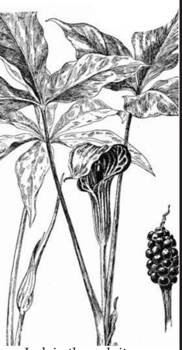
Jack in the pulpit